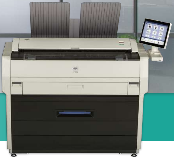
Single Footprint - KIP 7170 Multifunction System